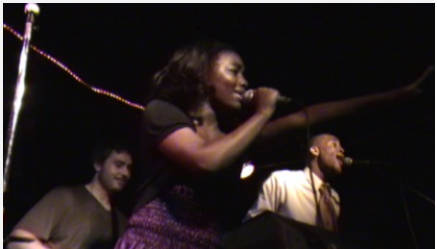
The Fly at Sidewalk Cafe

Filed under: Summer Concerts 2010 | Tags: Best Coast , Free Energy , The Fly , Loose Limbs